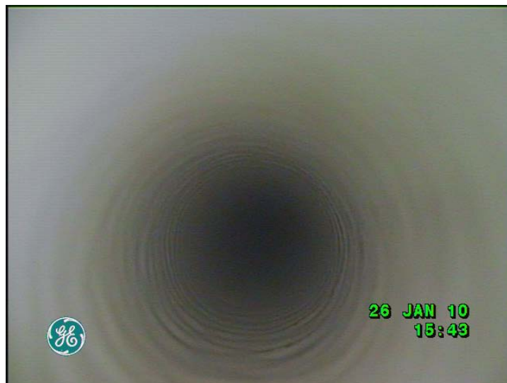
Below: picture of same tube ID