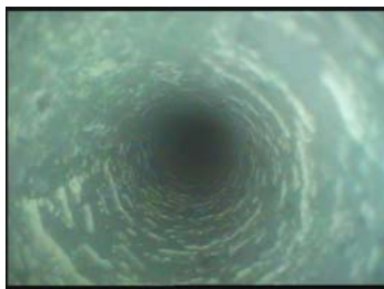
Down-tube image of 0.75" diameter tube cleaned to NACE - 1 "white metal." The video probe is effective at magnifying the surface; images of deeply pitted tubes are viewed from alternate tube sheets for a complete visual evaluation.

Another helpful advance in surface preparation occurred in the use of high-resolution video probes to verify tube interior cleanliness for grit blasting. The latest video probes can now identify extremely small surface imperfections, making it easier to spot residual scale and confirm surface cleanliness.