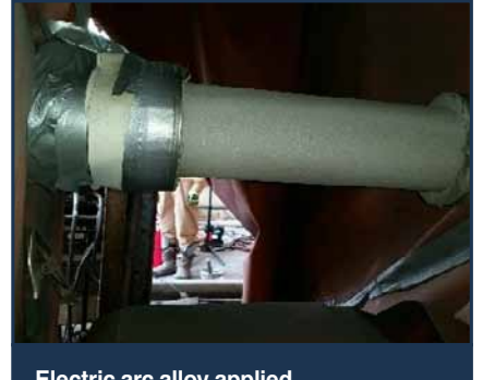
Electric arc alloy applied