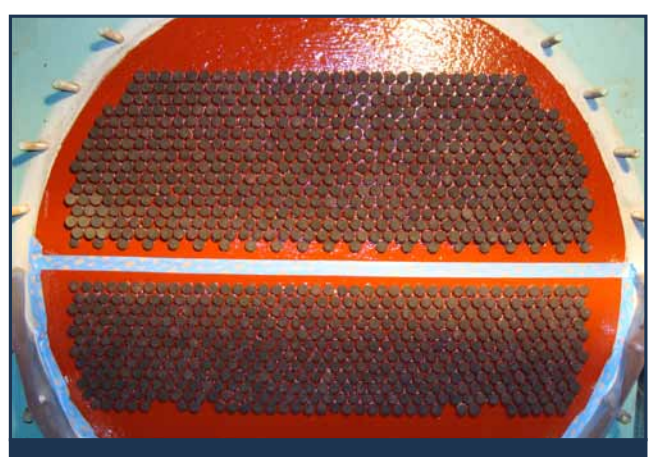
After Curran 500 Coating; tubesheet is protected from galvanic corrosion, with tube and tubesheet crevice joints sealed.