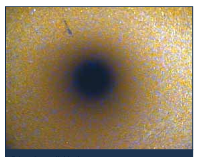
Tubes after scraper cleaning