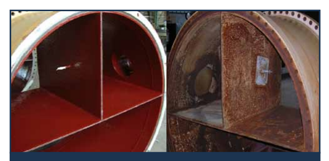
Exchanger cooling water channel, protective coating was used to augment the use of anodes in corrosive cooling water service. Channel coating selection should consider cold wall risk, and exposure to high temperature excersions and steam out.