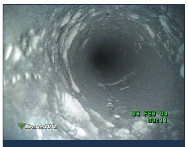
White metal clean ID; corroded exchanger tube in cooling water service

Tube cleanliness also contributes to return of heat transfer duty. The Curran Clean Method provides the best ID cleanliness for installation of full-length alloy liners. Curran Clean Method also provides NACE 1 white metal cleanliness for tube ID restoration coating application.